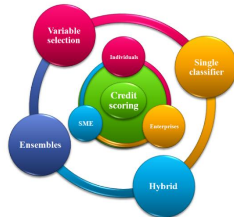
Figure 2. Classification framework for intelligent techniques in credit scoring

Although some differences can be found for scoring of export guarantees, EXIM banks and other